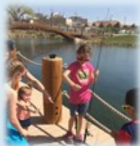
"This feels like a family reunion!"