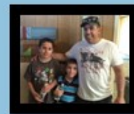
"You ladies know how to throw a party."