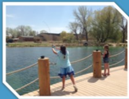
"This was so fun! Can we do more things like this?"